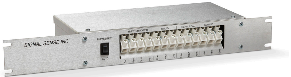
ATS/PMM A2022WRM-RACK MOUNT