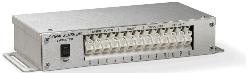
ATS/PMM-A2022WWM- WALL MOUNT

ATS PMM enables the removal of inverter for service without interruption to intersection operation.