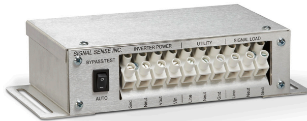
ATS/PMM-A2022WWM- WALL MOUNT

ATS PMM enables the removal of inverter for service without interruption to intersection operation.