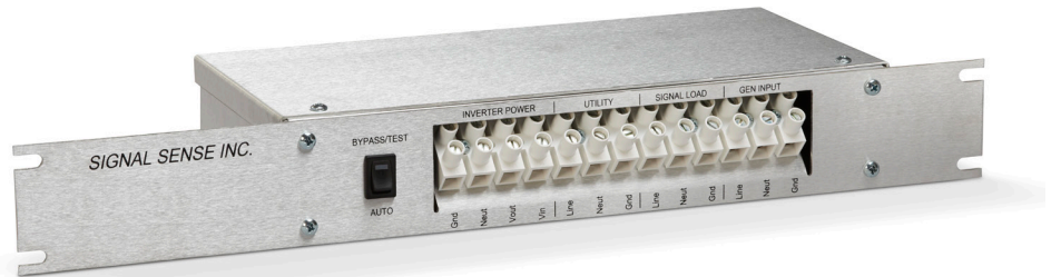
ATS/PMM A2022WRM-RACK MOUNT